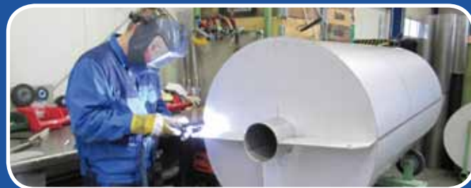
Stainless steel containers and casings