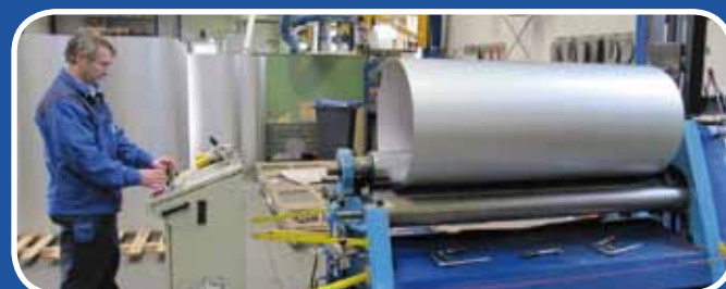
Individual manufacturing of tubes in various forms of stainless steel and mild steel.