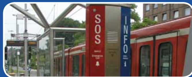
Stainless steel is renowned for its durability in many kinds of structures, from simple protective casings to highly complex terminals.

Nießing also manufactures functional containers which can be very unusual in terms of their shape and components. Small production runs and individual manufacturing complete the range of services on offer. Flexibility and reliability are common demands for all projects.